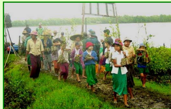
MSN - Children Mangrove Planting

In Myanmar , MAP Asia has been networking with the Mangrove Service Network (MSN) for a number of years and this positive mutual relationship is now expanding to on the ground mangrove restoration through a MSN, Diakonie Emergency Aid - Germany supported project in the Ayeyarwady Delta region with the objective to mitigate global climate change and sea level rise.