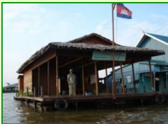
DATE- Community Resource Centre, Tonle Sap

In Cambodia , MAP Asia has been partnering with the Participatory Management of Coastal Resources of Cambodia (PMCR) project under the Nature Conservation and Protection Department, Ministry of the Environment on a coastal resources conservation project including mangrove restoration in Koh Kong Province since 2003.