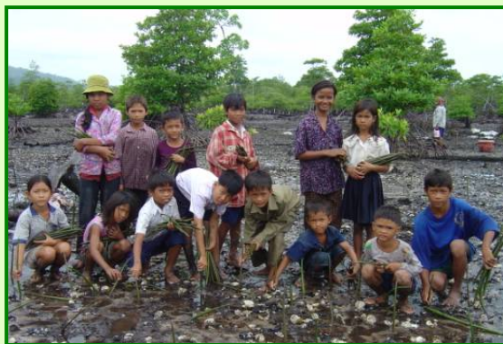
PMCR - Community Mangrove Restoration Programme

The Mangrove Action Project (MAP) established its first regional office in Thailand in 2001, first as the Southeast Asia Office, and then in 2006 broadened to become the MAP Asia Office to oversee projects in both Southeast and South Asia. Presently, MAP Asia is collaborating with partners and / or co-funding projects in Thailand, Cambodia, Burma (Myanmar), India, Andaman Island, Bangladesh and Sri Lanka. MAP Asia has also co-organized and co-facilitated nine "In the Hands of the Fishers" (IHOF) and Ecological Mangrove Restoration (EMR) training workshops in Cambodia, Indonesia, Thailand, India and Sri Lanka.