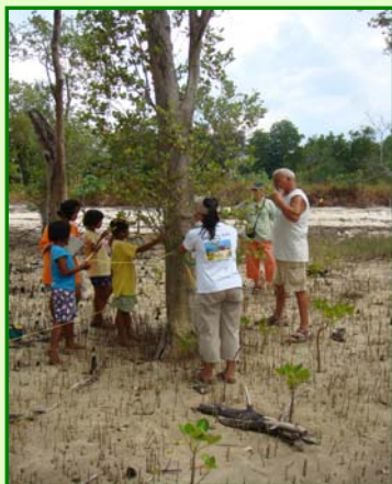
Mangrove Activity Day Koh Pra Thong, Thailand

MAP-Asia is now undertaking an Environmental Education project at Phra Thong Island, in Phang Nga Province in southern Thailand in partnership with Naucrates Onlus, an Italian NGO working on sea turtle conservation and mangrove conservation. At Phra Thong MAP has also co-funded and assisted Naucrates with a post tsunami Ecological Mangrove Restoration (EMR) project in a heavily damaged mangrove with high bio-diversity. MAP Asia in collaboration with Wetlands International - Thailand Programme is now in the planning stage of undertaking a larger EMR project in Krabi province which will be used as a model for future EMR trainings.