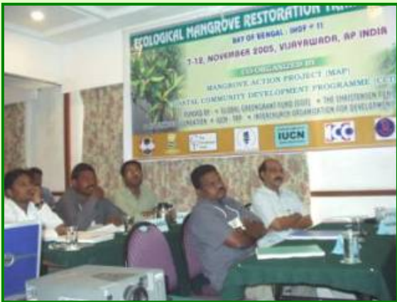
Ecological Mangrove Restoration Training, Andhra Pradesh, India

MAP Asia has collaborated and networked with a number of NGOs in India over the years and most recently with Coastal Poor Development Action Network (COPDANET) in Tamil Nadu, Sandhan Foundation in Orissa, and Coastal Community Development Programme (CCDP) in Andhra Pradesh. The focus of these projects has involved partners developing Community Coastal Resource Centres in Orissa, Tamil Nadu, and the Andaman Islands based on MAP's promotion of the Small Fishers of Sri Lanka (SFFL) CCRC model near Chilaw. Work has also focused on environmental education, mangrove restoration, and training on Ecological Mangrove Restoration (EMR).