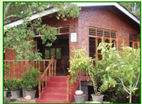
SFFL - Kiralakele Mangrove Resource Centre, Sri Lanka

In Sri Lanka , MAP's long term partner the Small Fishers Federation (SFFL) has been the focus of the CCRC model concept which has now expanded to other countries in Asia, Africa, and Latin America and was an important training facility for three of MAP's IHOF workshops. SFFL has also been the host of a MAP Eco-study tour, and helped undertake a MAP study in Better Practices in Shrimp Aquaculture, as well as implemented several alternative livelihood projects. MAP-Asia has recently partnered with Sewalanka Foundation to organize two workshops in Sri Lanka-- a national and community-based training on Ecological Mangrove Restoration (EMR).