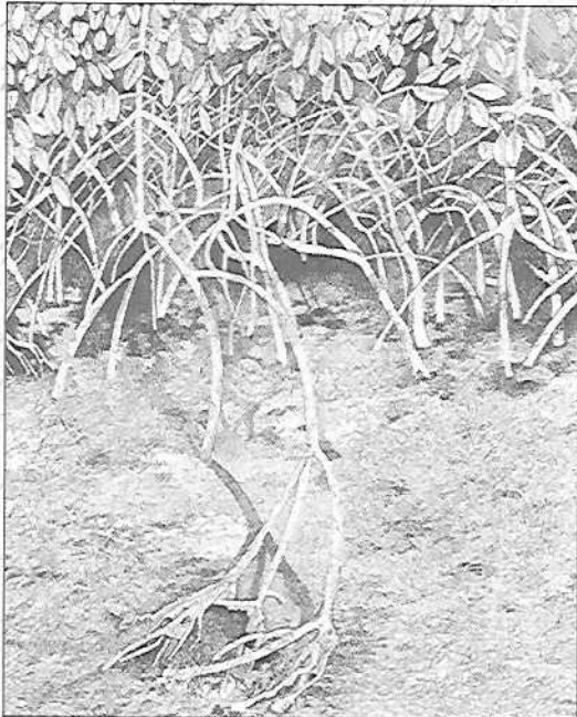
Illustration of Prop Roots and Drop Roots: These roots reach from stems and branches down into the soil below.

As noted by Cahoon and Hensel (2002), such areas may never be suitable for mangroves again, and may therefore convert to shallow open water habitats. True restoration of such areas would require the placement of enough sediment to raise the elevations into the proper zone to support mangroves, and perhaps planting of mangroves if propagule limitation still existed. This would be a very expensive engineering challenge, as it would likely require dredging of sediments and their placement in former mangrove areas. Similar intended and unintended mangrove forest creation and restoration has occurred in the United States with the creation of dredged material islands (spoil islands) associated with harbor dredging projects in Florida (Lewis and Dunstan 1974, Lewis 1982, Lewis 1990), but is unlikely to be an affordable option in third world countries.