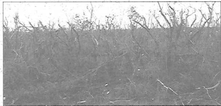
Figure 2 - Mangrove forest damaged by hurricane Charley near the City of Punta Gorda in early September 2004.

An example of severe and long-lasting effects of a hurricane on mangroves is the island of Guanaja, one of the Bay Islands of Honduras. Extreme winds and flooding produced 97% mortality of the mangroves and regeneration has not occurred. In situations such as this, the resulting absence of root growth in highly organic peat soils has resulted in the collapse of the soils due to oxidation, and an actual lowering of the ground elevation formerly occupied by mangroves (Cahoon and Hensel 2002). As noted by Lewis (in press), mangrove forests around the world are limited in their range of elevations of the soil surface upon which they can grow. In fact, a failure to understand this fact has led to large scale failures in attempts at mangrove restoration when plantings were attempted on mud flats situated at a tidal elevation too low to support mangroves (Lewis 2000, Lewis in press). Areas of damage from hurricane Mitch may therefore be topographically too low for successful restoration by simply planting mangroves in areas where natural seedling recruitment is absent due to a lack of enough live trees in the vicinity to produce a viable and abundant seed crop. This lack of natural seeds is referred to as “propagule limitation” by Lewis (in press).