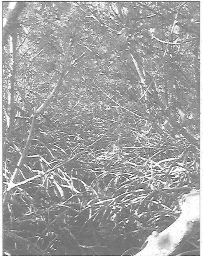
Figure 1 - a mangrove forest dominated by the red mangrove ( Rhizophora mangle ) near Key West, Florida.

"Banda Aceh is built on the mainland as well as a series of low-lying islands in the delta of the Krueng Aceh River. The area originally would have been covered with mangrove forest but most of the forest was cleared during the development of the town. To the west of the town along the coast a large area of mangroves was cleared in the last 30 years or so and converted to fish and prawn ponds. A number of patches or small islands of mangroves remain in the branches of the delta and