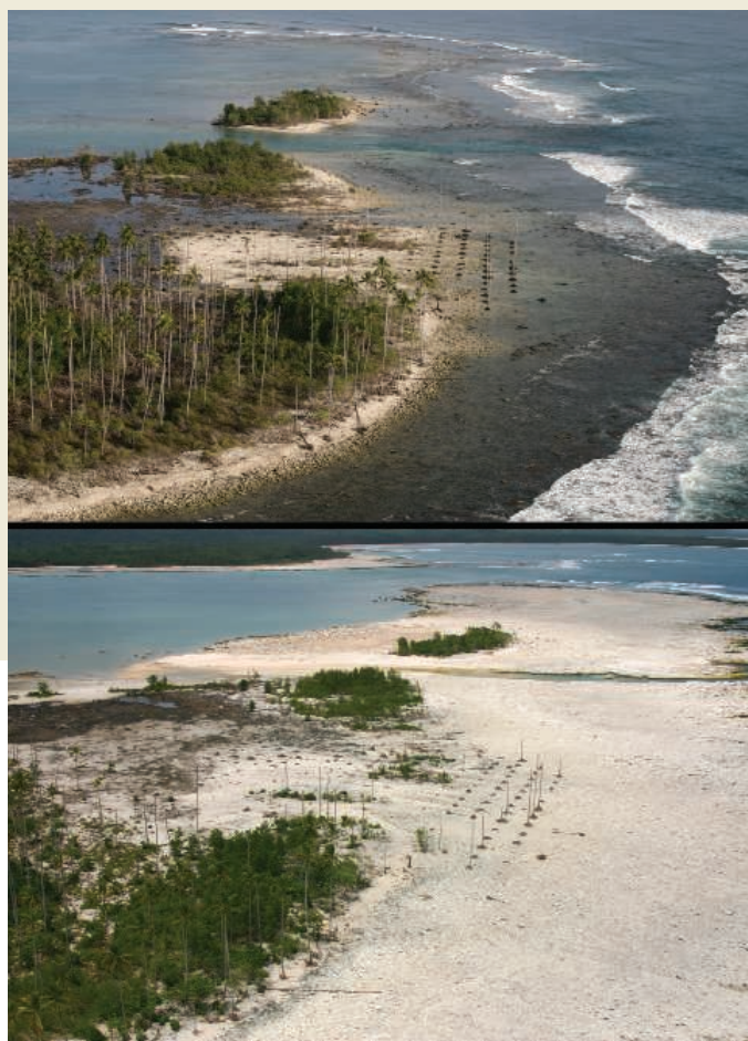
Flip-flop. Before the 2005 rupture, Nias's southwest coast was subsiding, as indicated by the stand of dead coconut palms seaward of the beach (top). The rupture lifted the coast here 2.5 meters.

the nongovernmental organization didn't anticipate the difficulty of moving it inland to homesteads in Tagaulei Two. The delays have created tensions with the villagers. "Our staff have been threatened with knives," he says. AMDA is planning a second lumber shipment for next month and aims to complete all homes by the end of January. "Now," says Usami, "we're moving very fast."