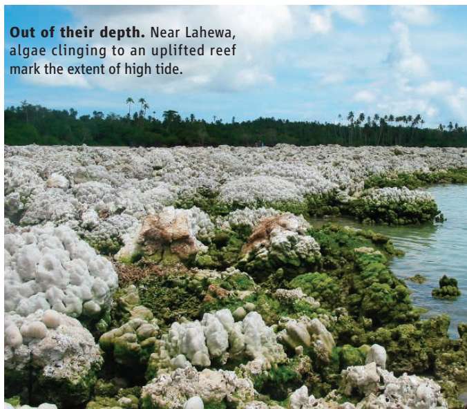
Out of their depth. Near Lahewa, algae clinging to an uplifted reef mark the extent of high tide.