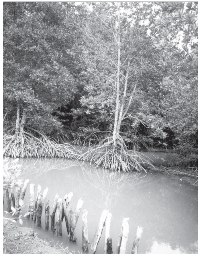
Rhizophora mangroves such as these play a critical role for fish habitat and they contribute to preservation of other coastal systems including seagrass beds and coral reefs.

When it first started, Yad Fon targeted four villages for its project work. Five years later, these successful target villages