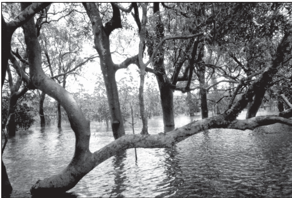
Mangrove forests in southern Thailand's Trang Province ring the Andaman Sea and are the conservation focus of Yad Fon Association.

of the entire community. Yad Fon Association has assisted some of the poorest communities in coastal Thailand by helping them restore the ecosystems on which the villages depend—and through conservation, helping them restore the village structure as well.