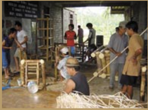
bamboo furniture building workshop

25 villagers from Tiwoho, Wori were trained in the art of making high-quality bamboo furniture as part of a sustainable livelihood program at their Coastal Community Resource Center.