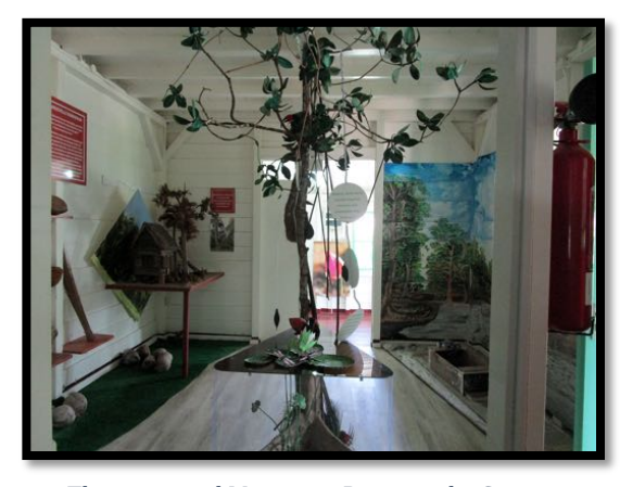
The revamped Mangrove Room at the Coronie (Suriname) Mangrove Education Centre

Following the pilot of Marvellous Mangroves (Dutch version!) in Suriname, a review and additional workshops were