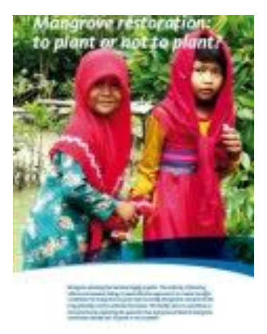
Mangrove restoration: to plant or not to plant? <u>download</u>

(MAP) in Thailand was part of an IUCN 5-year project called Ecosystems Projecting Infrastructure and Communities (EPIC) which just finished at the end of August 2017 and focused on Eco-Disaster Risk Reduction *(DRR), which had been mainly inspired by the 2004 tsunami disaster and rising sea levels and intense storms fomented by global warming. The project involved 6 countries and a range of hazards such as landslides, avalanches, desertification and coastal storms were involved. Here is an excerpt from that final report: