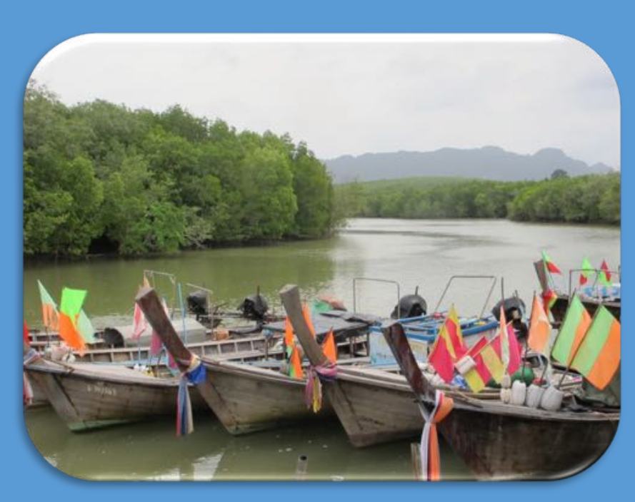
MANGROVE ACTION PROJECT