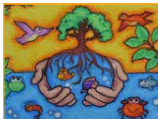
October | United Arab Emirates