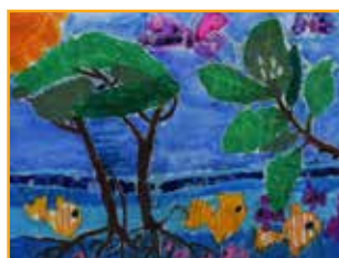
July | USA