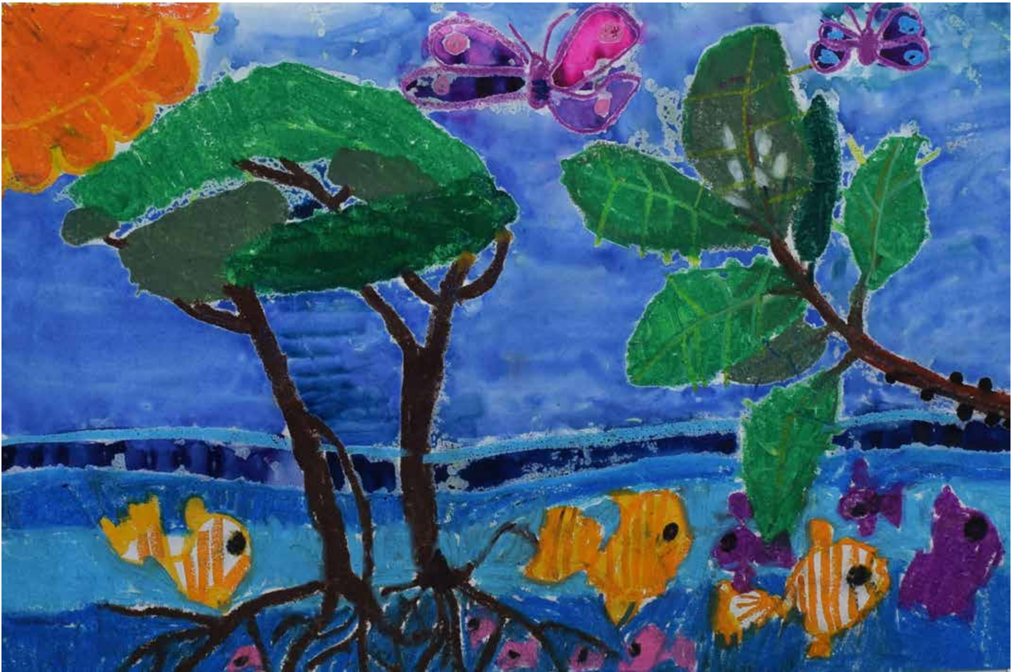
Mahita Tangirala, USA