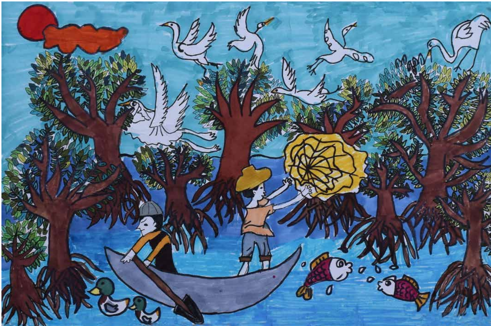
Xintong Zhon, China