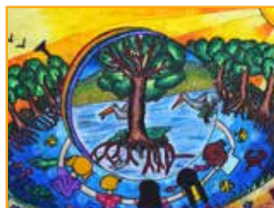
March | India