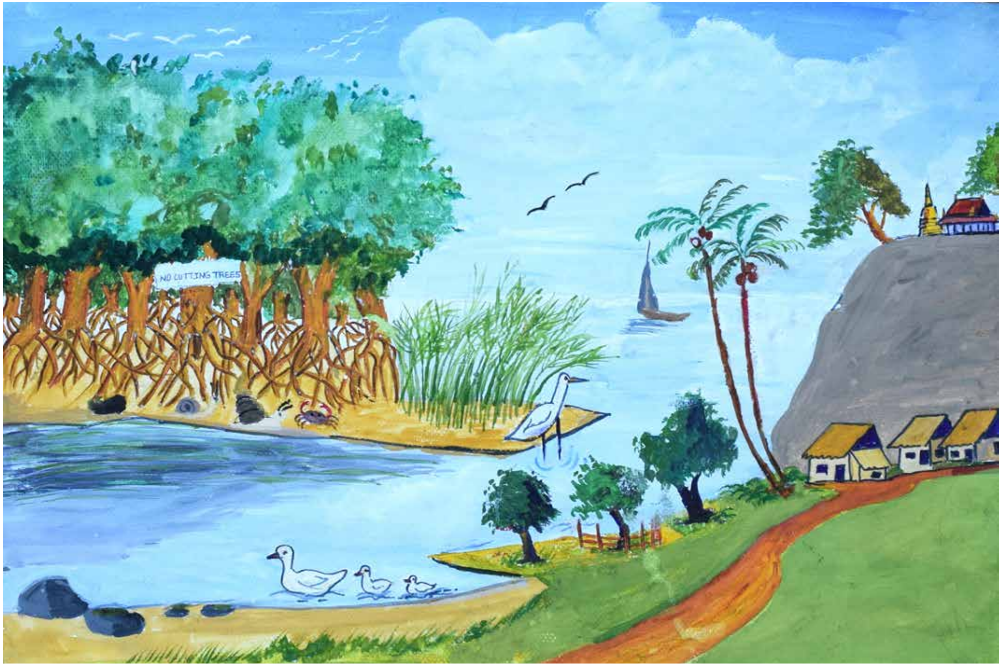
MA Theint Thheint Than Zaw, Myanmar