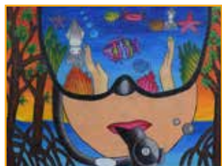
January | Thailand

M angrove Action Project (MAP) is an international nonprofit organization whose mission is to help educate the world on the importance of mangrove forests, and to promote their conservation and restoration. We have had a positive impact on coastal ecosystems and communities over the past quarter of a century, and each year we celebrate our important work by hosting an international art contest where youth around the globe submit mangrove artworks. Thirteen winners of our contest are chosen annually, and their drawings are selected to be displayed on the calendar cover and to represent each of the twelve months of the year.