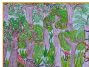
April | Suriname