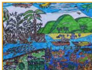
November | Seychelles