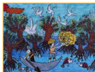
August | China