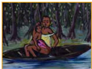
September | Nigeria