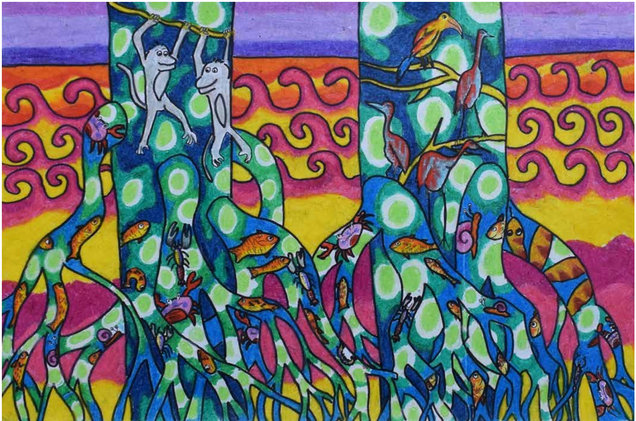
Dadi Prayoga, Indonesia