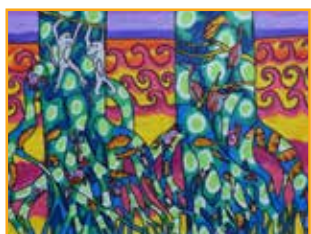
May | Indonesia