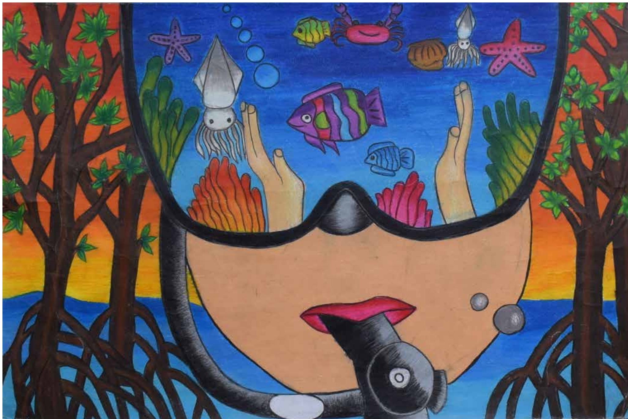
Saranyu Aengchuan, Thailand