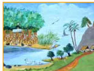
December | Myanmar